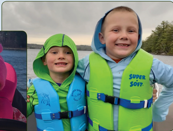
Milfoil trembles at the sight of this crew!