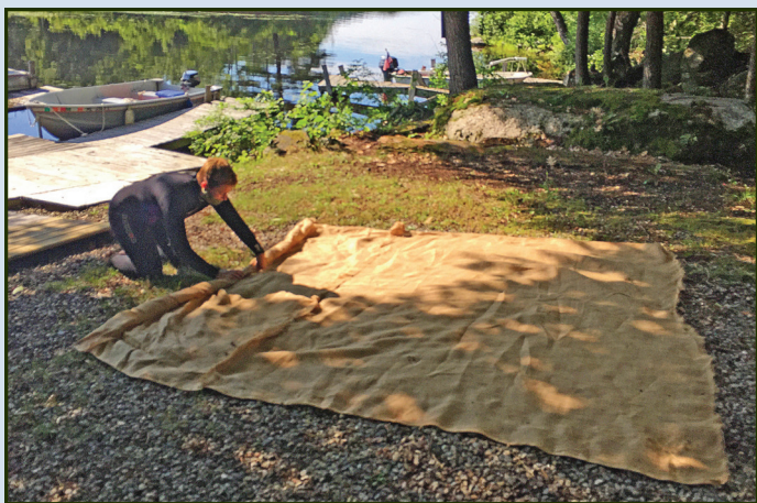
Getting a burlap barrier ready to be laid over milfoil to prevent growth