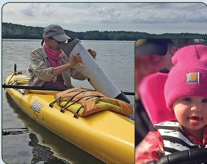
Searching for milfoil with the Aquascope.

Thank you for your vigilance and your very generous donations. With your continued support, this is a battle we can keep on winning!