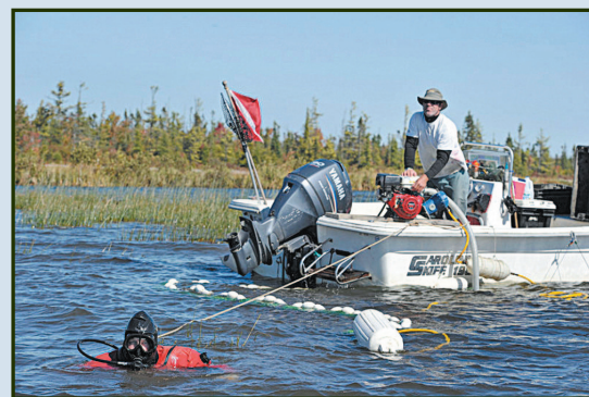
Diver-Assisted Suction Harvester (DASH) boat and crew at work in North Bay.